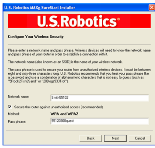
Input a simple pass phrase to set up powerful security!

Unique in the industry, SureStart seamlessly installs your MAXg PC Card, USB or PCI Adapter, if appropriate a MAXg Router, validates wireless connections, and helps to easily configure security. Complex WPA2 security is as easy as enabling security and typing in a pass phrase. PPPoE and cable modem detection are built in to make configuring your Internet connection a snap. Whether your networking needs are relatively simple or incredibly complex, U.S. Robotics